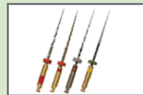
Most popular files identified in survey (left to right): WaveOne Gold, ProTaper Gold, EndoSequence, and EdgeFile