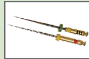
Two examples of low cost NiTi files: EdgeFile by EdgeEndo (upper) about $4, and EndoFlex by Henry Schein (lower) about $6

CR surveyed clinical users and performed controlled tests to compare low-cost files to conventional files to determine notable similarities and differences. The following report includes survey data on current use, a comparison of low-cost files to other popular brands, clinical tips, and CR conclusions.