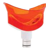
BLEACH ARCH ATTACHMENT