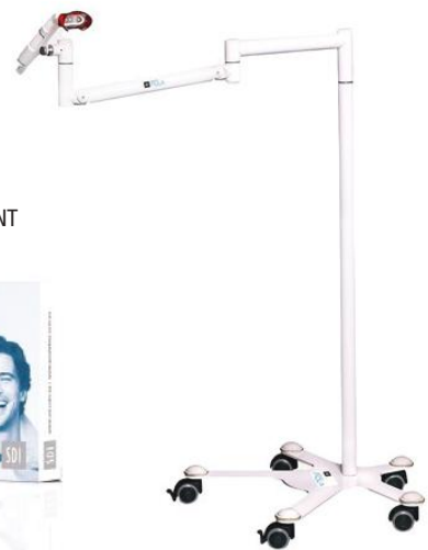
POLA STAND 2

PLUS SAVE OVER $1,900.00 ON FREE PRODUCTS