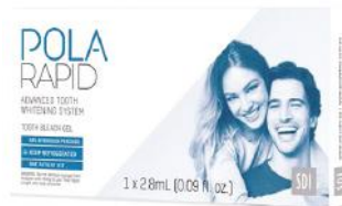
Pola Rapid 1 Patient Kit with Optra