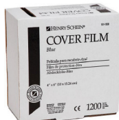
Henry Schein Coverall Barrier Film Adhesive backing 6" x 4" 1200 per roll HS-100-9869 Clear HS-1011838 Blue