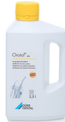
Orotol Plus Disinfection Concentrate Solution DU-CDS110P61 2.5 Litre (For Durr Suction Motors only)