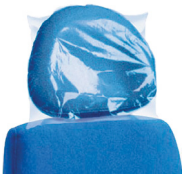
BioProtect Head Rest Covers BIP-HRC01 25.4 x 25.4cm, Pkt 500