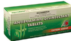
Cattani Anti-foaming Disinfection Tablets CA-M040825 Box of 50