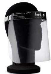
Bolle Face Shield DFS4 Clear Visor & Adjustable Headband BL-PFSDFS4107S Each