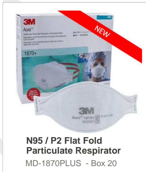
N95 / P2 Flat Fold Particulate Respirator MD-1870PLUS - Box 20