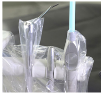
BioProtect Triple Handpiece Barrier with Slit BIP-THB01 26cm x 6.5cm, Pkt 500