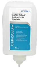
Microshield Angel Clear Antimicrobial Hand Gel SK-70001757