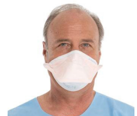
Halyard Fluidshield N95 Surgical Respirators EO-23626727 Box 35