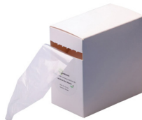
BioProtect Long Handpiece Barrier BIP-LHB03 45 L x 5.5cm W, Pkt 250