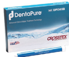
DentaPure Waterline System CR1-DP365B Water Bottle Cartridge System CR1-DP365M Municipal Waterline Cartridge System