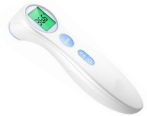
Infrared Forehead Thermometer HS-1381505 Each