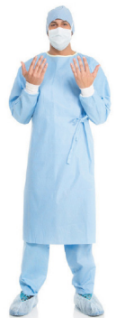
Evolution Surgical Gown EO-35955120 Large, Pkt 6