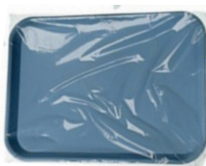
Henry Schein Tray Barriers HS101-4275 10.5 x 14" , Pkt 500