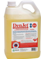
DenJet Daily Cleaner For routine daily cleaning of aspiration & suction lines MJ-DJDS-5 5 Litres