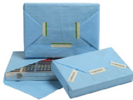
IMS Autoclave Sterilisation Wrap HF-IMS1213 12" x 12" 1000 sheets Sterile cassette wrap doubles as a tray barrier