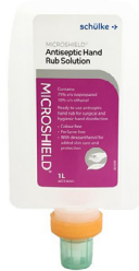
Microshield Antiseptic Hand Rub Solution 1L SK-70001831