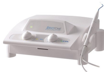
Acteon Servotome II Electrosurgical Unit $4,490