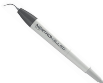
Acteon All Satelec Newtron Handpieces $827.25 Non-Optic Scaler HP S5-F12281 $1,083 LED HP S5-F12609 $1,666.50 Slim B LED HP S5-F12900