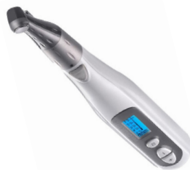
Morita Tri Auto Mini Endo Handpiece $2,381.84