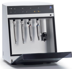
Morita Lubrina 2 Handpiece Maintenance System $2,997.50