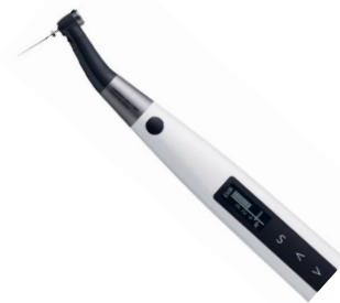
Morita Tri Auto ZX2 Plus Endo Motor $3,435.45