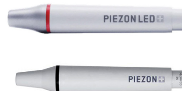
EMS All Piezon No-Pain Handpieces $1,029 Non-LED (Blue O-Ring) EMS-EN061 $1,659 LED (Red O-Ring) Set EMS-FS455